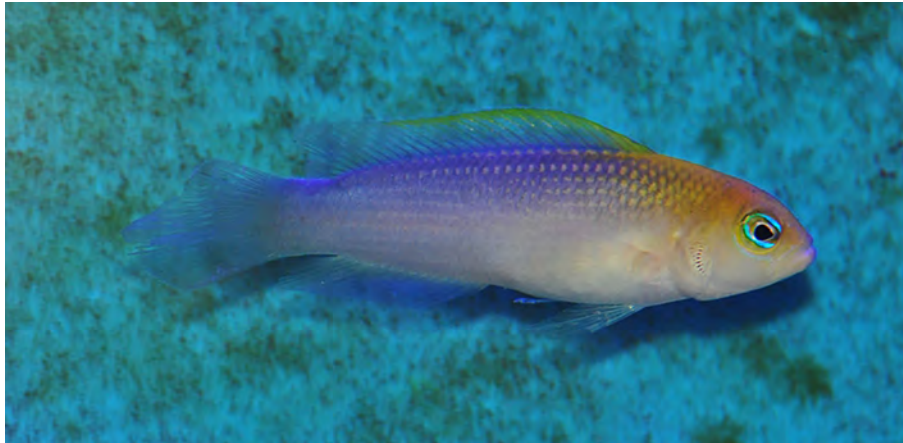
FIGURE 5. Pseudochromis sp., aquarium photo of individual from Cebu, Philippines. Note the fish was photographed under artificial lighting that has imparted a violet/blue cast on the fish.

Preserved coloration: head and body dark greyish brown dorsally, becoming pale yellowish brown ventrally; yellow spots and markings on head, body and fins become pale yellowish brown; curved blue marking behind eye becomes greyish brown; bluish grey to blue markings on fins become greyish brown.