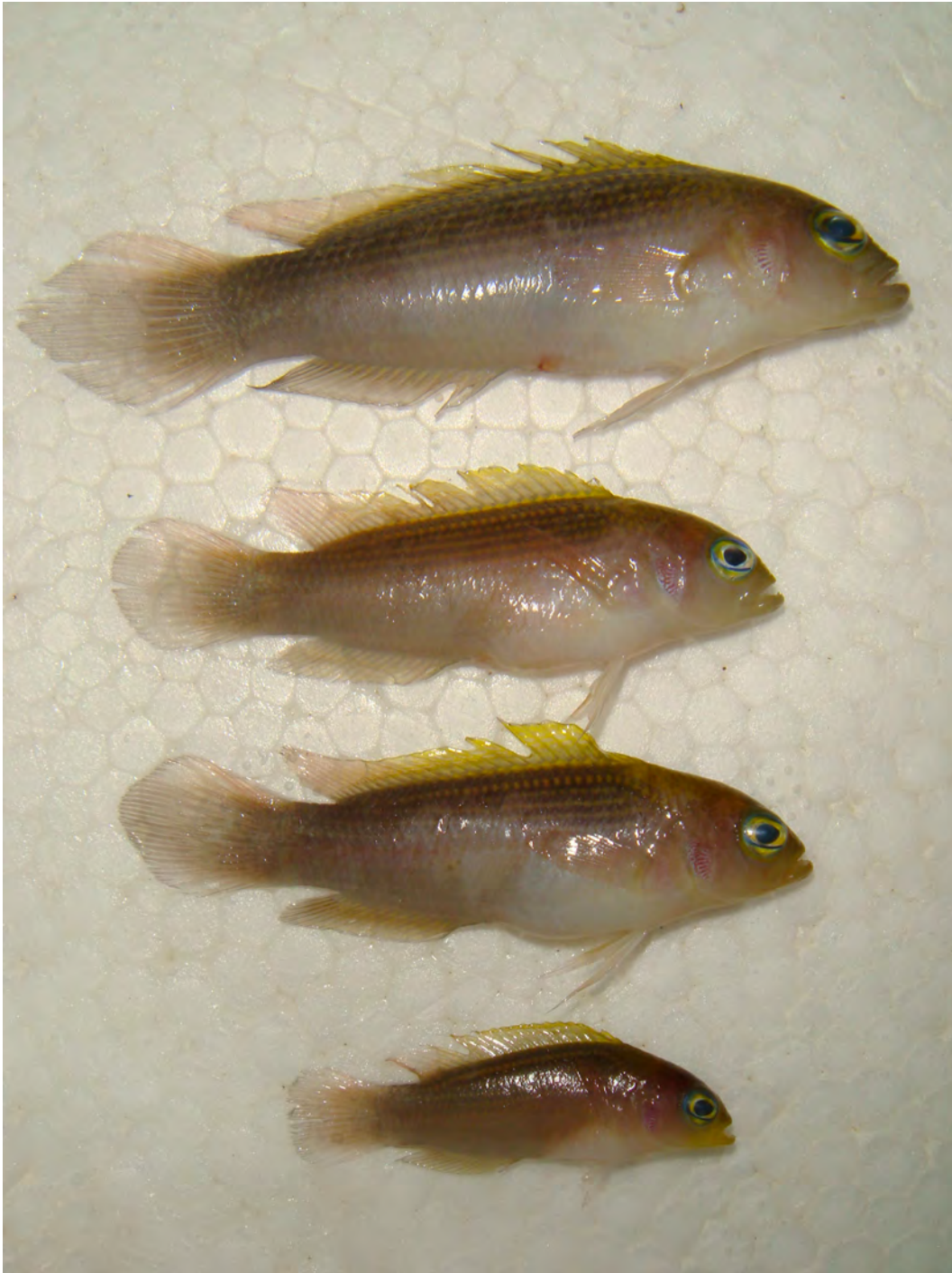
FIGURE 2. Pseudochromis stellatus, paratypes, AMS I.47330-001 (third from uppermost specimen) and WAM P.33630-001 (all other specimens), Batu Hitam, Raja Ampat Islands, Indonesia.

As percentage of SL: head length 27.2–28.6 (27.5); orbit diameter 9.7–11.8 (9.7); snout length 6.2–7.6 (6.2); fleshy interorbital width 5.4–6.0 (5.4); bony interorbital width 4.1–4.5 (4.1); body width 12.5–13.3 (12.7); snout tip to posterior tip of retroarticular bone 14.8–16.1 (14.8); predorsal length 33.5–35.7 (35.1); prepelvic length 30.7–32.6 (32.5); posterior tip of retroarticular bone to pelvic-fin origin 17.6–18.6 (18.3); dorsal-fin origin to pelvic-fin origin 31.8–33.5 (32.9); dorsal-fin origin to middle dorsal-fin ray 32.9–35.1 (35.1); dorsal-fin origin to anal-fin origin 43.5–45.2 (45.2); pelvic-fin origin to anal-fin origin 27.8–32.1 (30.5); middle dorsal-fin ray to dorsal-fin termination 23.7–26.7 (23.7); middle dorsal-fin ray to anal-fin origin 28.1–30.2 (28.6); anal-fin origin to dorsal-fin termination 34.0–37.6 (34.0); anal-fin base length 25.4–29.3 (25.4); dorsal-fin termination to anal-fin termination 16.0–17.8 (17.0); dorsal-fin termination to caudal peduncle dorsal edge 10.9–12.9 (11.6); dorsal-fin termination to