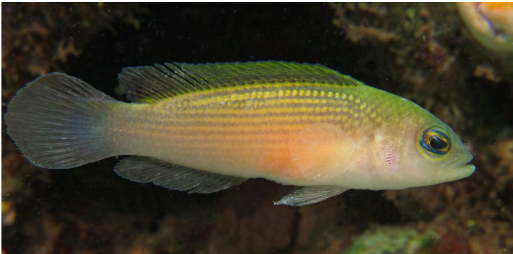
FIGURE 1. Pseudochromis stellatus , MZB 23884, 46.5 mm SL, holotype, Dayan Channel, Batanta, Raja Ampat Islands, Indonesia.

Paratypes. WAM P.33705-002, 1: 44.9 mm SL, collected with holotype; AMS I.47330-001, 1: 36.5 mm SL, Indonesia, West Papua Province, Raja Ampat Islands, Batu Hitam (0°4'57"S 130°4'59"E), 62 m, M.V. Erdmann, 5 December 2011; WAM P.33630-001, 3: 25.5–47.0 mm SL, collected with AMS I.47330-001.