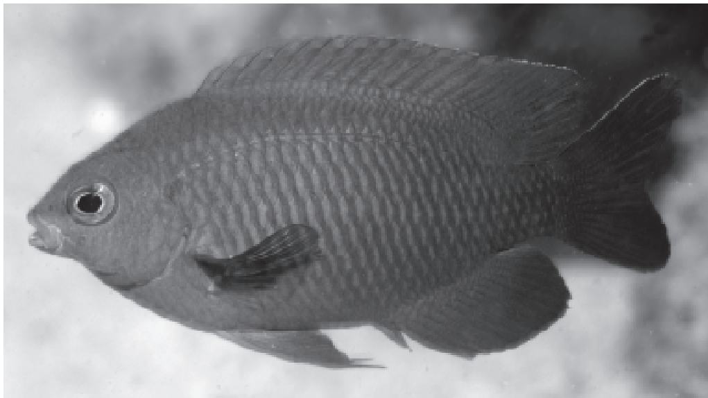
Figure 3 Underwater photograph of Pomacentrus fakfakensis , approximately 50.0 mm SL, Ogar Island, Papua Barat Province, Indonesia.

coast of the Fakfak Peninsula in the vicinity of Kokas Village. It was relatively common at both locations on silt-affected reef flats around coral and rock outcrops at depths of 2–8 m.