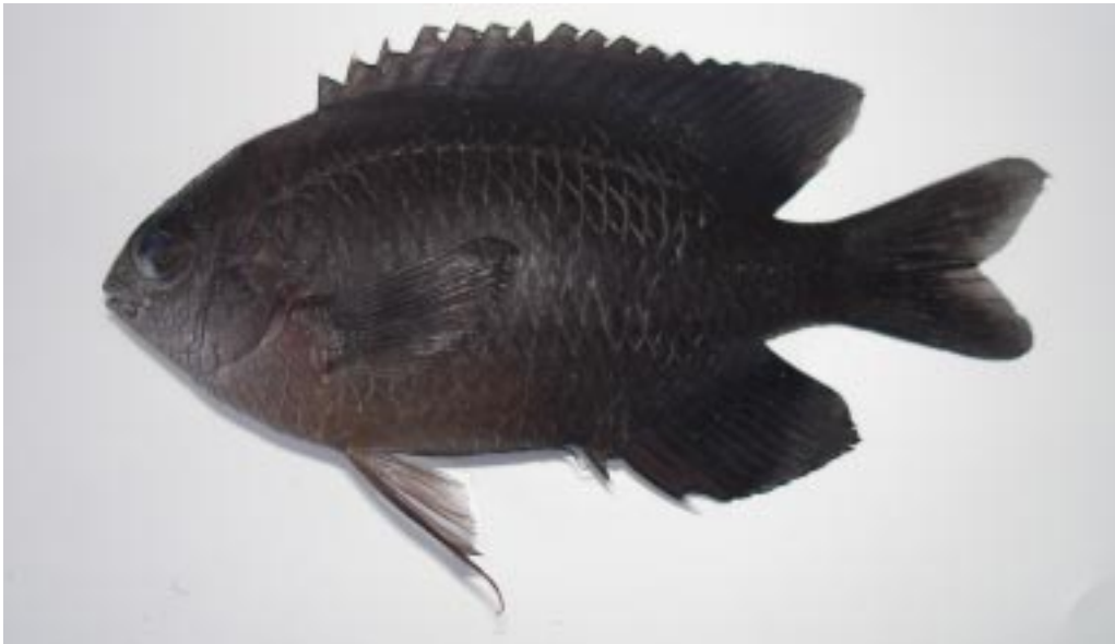
Figure 2 Pomacentrus fakfakensis , holotype, 52.2 mm SL, Karawatu Island, Papua Barat Province, Indonesia.