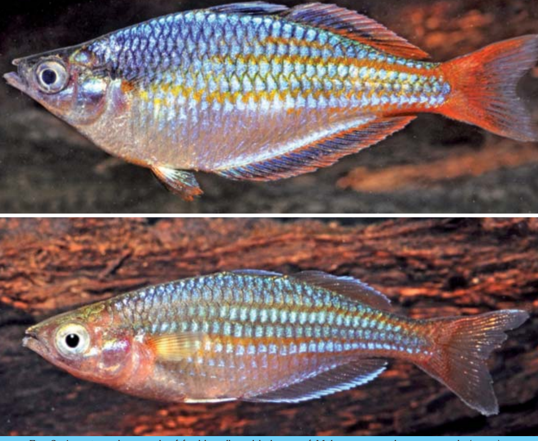
Fig. 2. Aquarium photograph of freshly collected holotype of Melanotaenia rubrivittata , male (upper), 48.7 mm SL and female paratype, 40.8 mm SL (WAM P.31454), Siewa, Papua Province. G.R.A.

Fig. 1. Map of Papua Province, Indonesia showing type locality (star) of Melanotaenia rubrivittata near Siewa, an abandoned mining exploration camp.