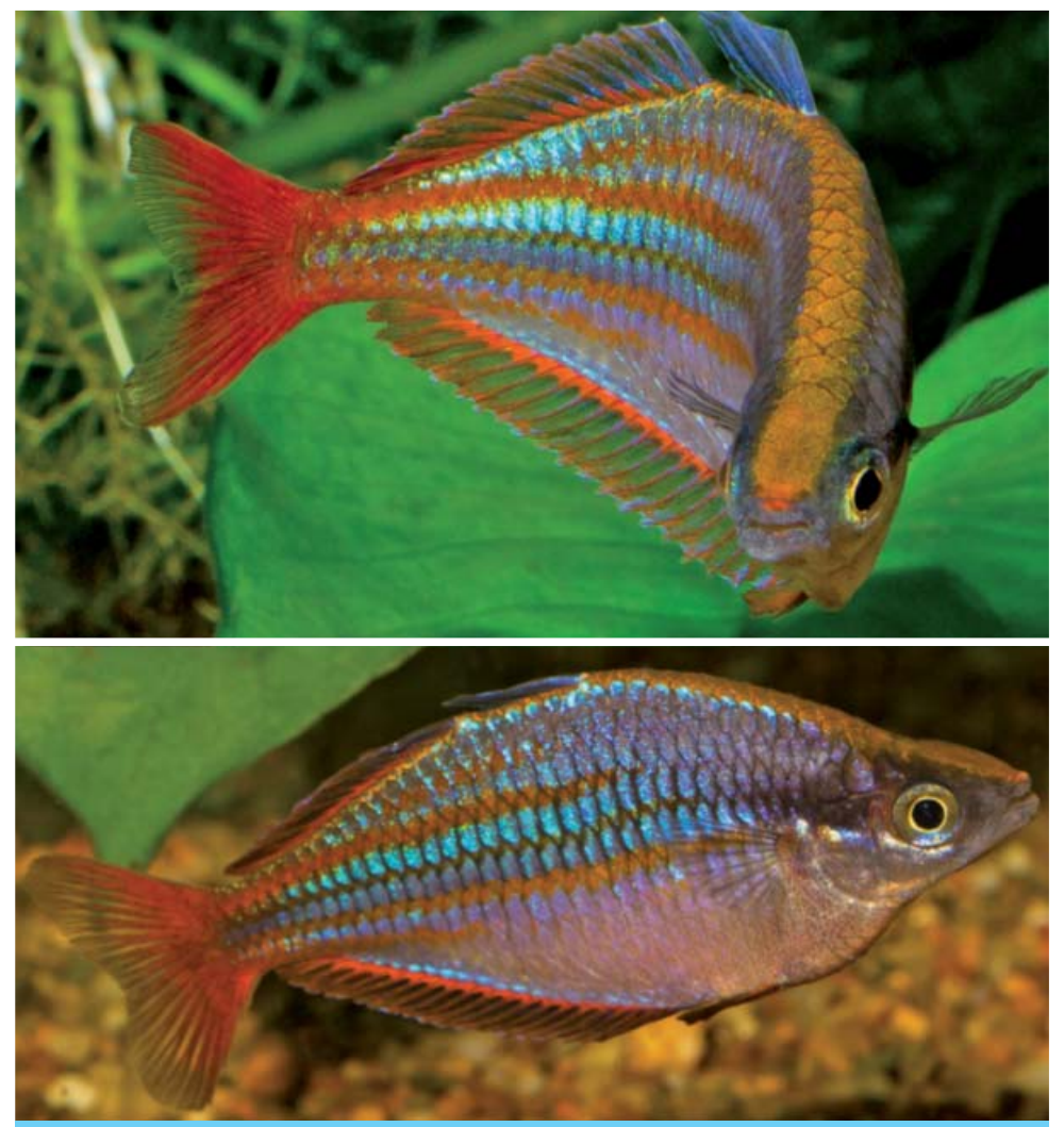
Fig. 3. Male specimens of Melanotaenia rubrivittata raised in captivity, approximately 45 mm SL. The nuptial display is shown in the upper photograph. G.L.

Diagnosis: A species of melanotaeniid rainbowfish distinguished by the following combination of characters: dorsal rays IV–VI-I,9–12 (usually V-I,10–11); anal rays I,17–21 (usually I,18–20); pectoral rays 10–13 (usually 11–12); lateral scales 32–33, predorsal scales 13–16 (usually 14–15); circumpeduncular scales 12; total gill rakers on first arch 12–14; total scales covering cheek (preopercle) 11–16 (average 8.9); snout length 3.2 (3.0–4.3) in HL; average body depth of adult males 37.7 % SL; colour in life brilliant neon blue on upper two-thirds of body with five red stripes (one between each scale row); ventral portion of head and body silvery white to blue with slight pinkish hue; first dorsal fin blue; second dorsal fin blue with red basal stripe and broad red zone encompassing outer margin and posterior portion of fin; anal