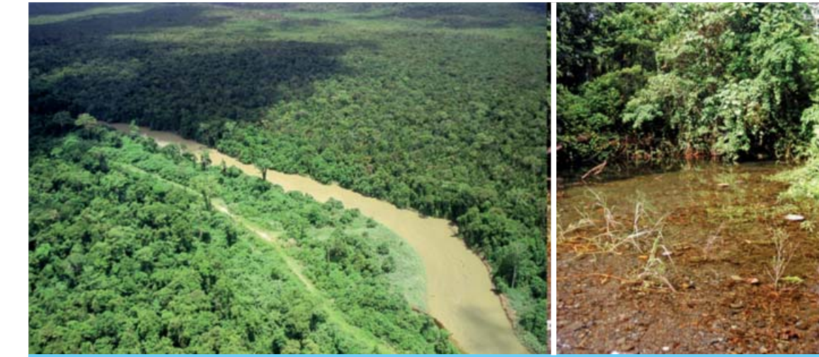
Fig. 7. Floodplain habitat of Tirawiwa River new Siewa, West Papua Province and type locality (right) of Melanotaenia rubrivittata. G.R.A.

We found evidence for mitochondrial introgression between Melanotaenia rubrivittata and Chilatherina alleni , based on their sister group relationship for cytb (Fig 6). Introgression is a result of an initial hybridisation event followed by an extensive backcrossing of the hybrids only into one of the parental species (usually), such that over time genetic material from one of the species becomes incorporated into the other (essentially via horizontal transfer rather than via common descent). This can arise under various scenarios, such as where one species is substantially more abundant than the other and thus limited in their choice of conspecific mates. Mitochondrial DNA can provide very strong evidence for this as it is only maternally inherited and is passed along clonally (meaning there is no recombination, which is quite different to nuclear DNA). Introgression has been recorded between a number of rainbowfish species, usually between those with sympatric distributions (Unmack et al. 2013). Clearly this introgression is not recent given there is a pairwise p-distance of between 1.0–1.6% for cytb between individuals within both species. As with the morphological evidence presented above, nuclear sequence data clearly place M. praecox and M. rubrivittata as sister species well