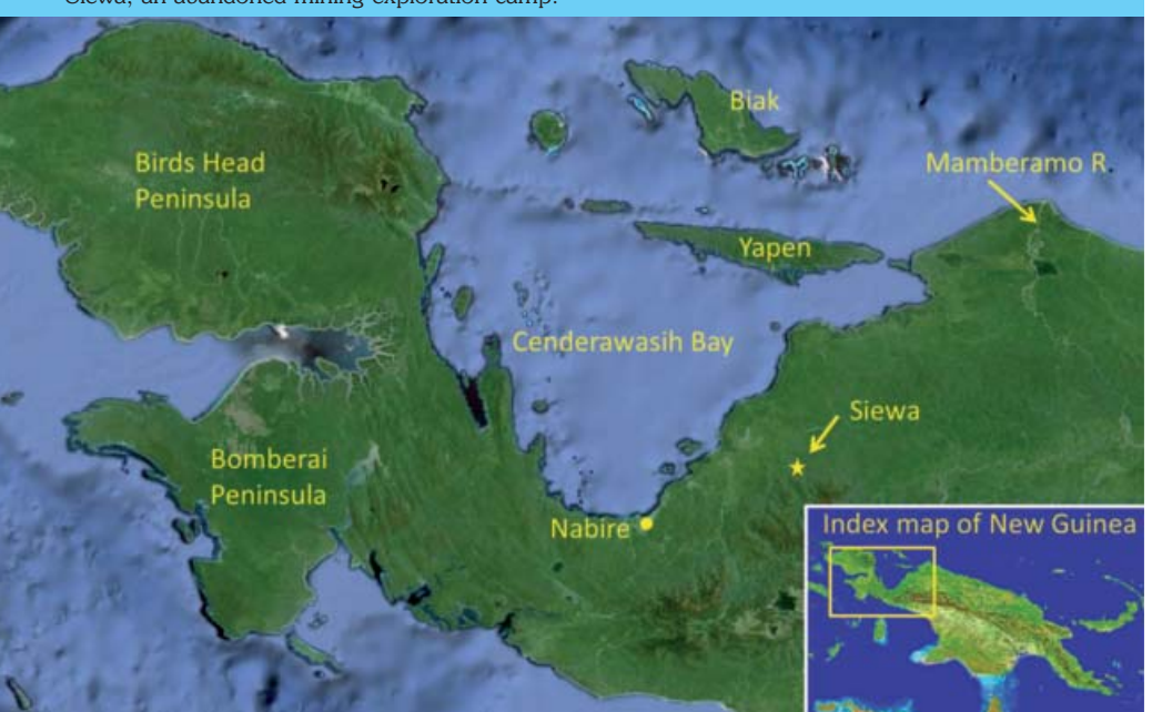
Fig. 1. Map of Papua Province, Indonesia showing type locality (star) of Melanotaenia rubrivittata near Siewa, an abandoned mining exploration camp.

The families Melanotaeniidae, Eleotridae (gudgeons) and Gobiidae (gobies) collectively make up over 50% (~280 species) of the freshwater fish species richness of Australia and New Guinea