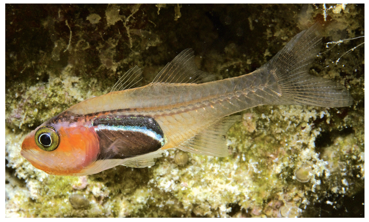
Figure 1. Cercamia melanogaster , holotype, 27.3 mm SL, underwater photograph, Fak Fak Peninsula, West Papua Province, Indonesia (M.V. Erdmann).