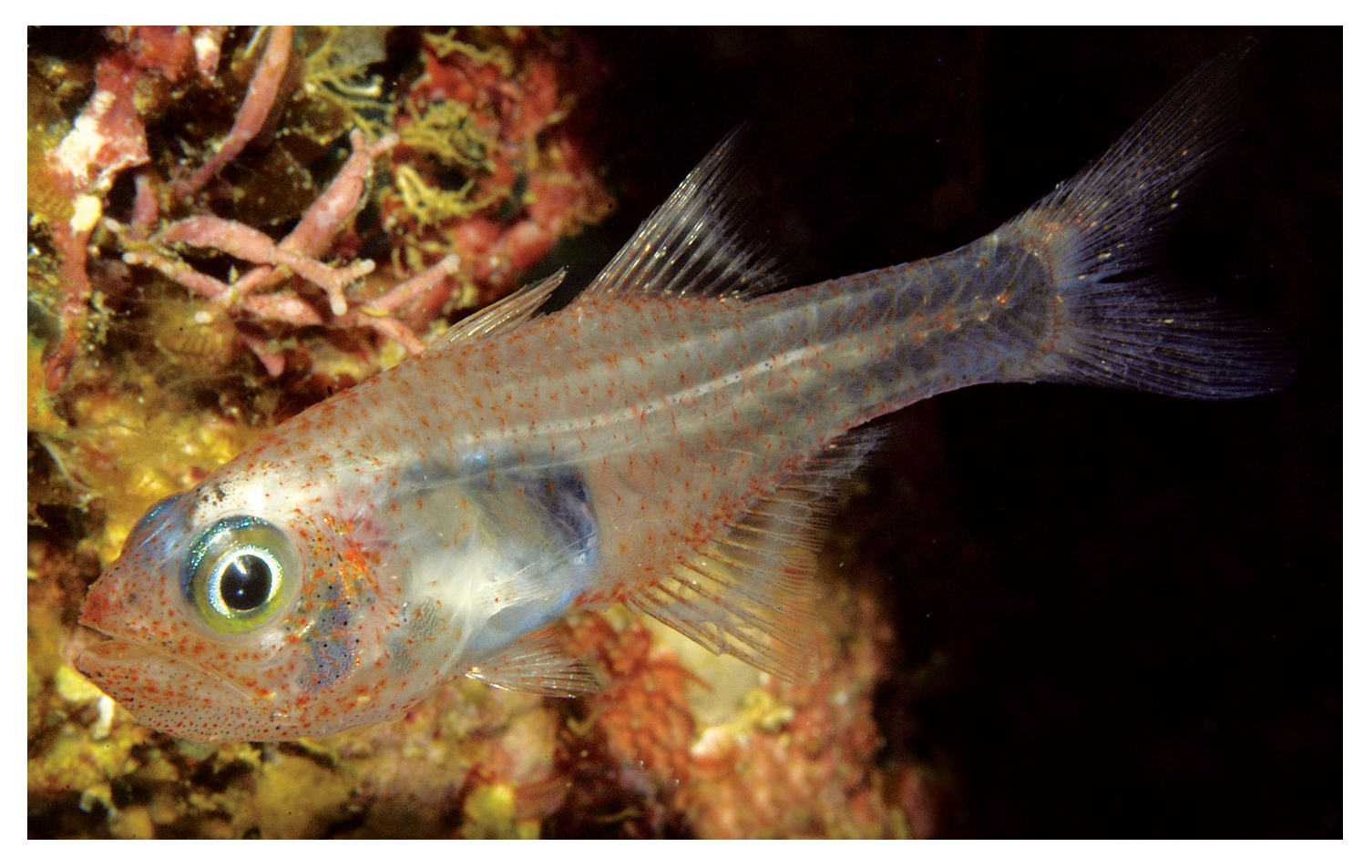
Figure 5. Cercamia eremia , underwater photograph, approximately 35 mm SL, Anilao, Batangas Province, Philippines (G.R. Allen).

Phylogenetics. We resolved relationships between Cercamia melanogaster and other Cercamia species using a 657-base-pair segment of the mtDNA COI gene from our three collected Cercamia individuals. In addition, available GenBank sequences for Cercamia cladara and Pseudamia zonata (an apogonid outgroup) were added to the analysis (Tables 2 & 3 and http://www.ncbi.nlm.nih.gov).