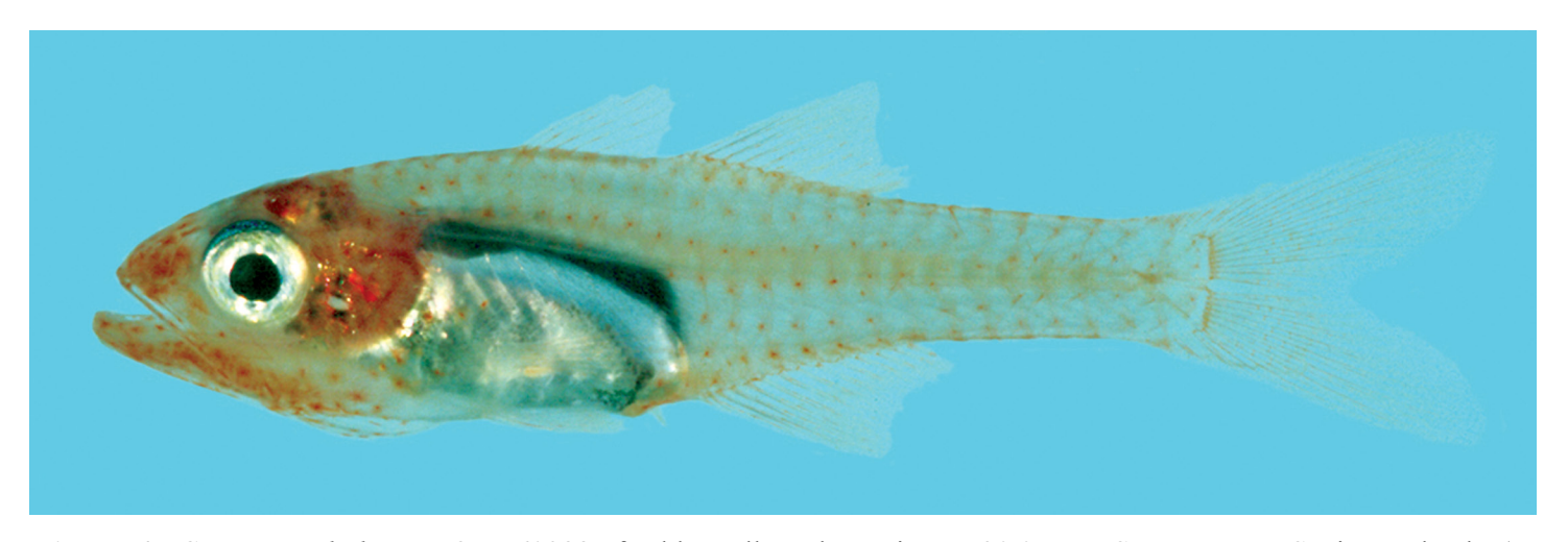
Figure 4. Cercamia cladara, ROM 60988, freshly collected specimen, 30.0 mm SL, Moorea, Society Islands (R. Winterbottom).

the head and blackish abdomen. However, the red areas are more diffuse in C. cladara (Fig. 4) and the abdomen is not entirely blackish as in C. melanogaster . Gill raker counts are essentially the same for C. melanogaster and C. eremia , but the diagnostic red mask and extensive dark colouration on the abdominal region are lacking in the latter species (Fig. 5).