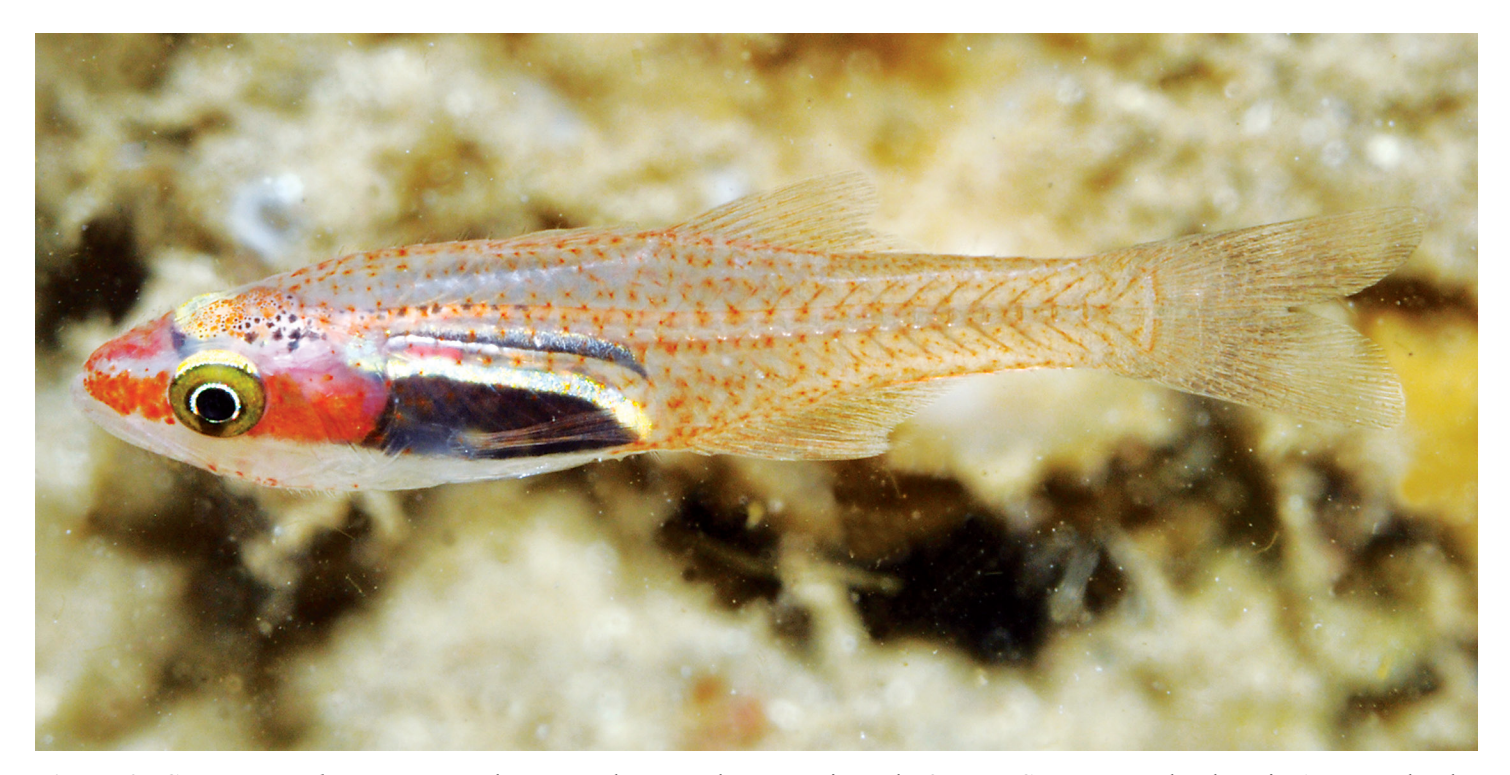
Figure 2. Cercamia melanogaster, underwater photograph, approximately 25 mm SL, Kawe Island, Raja Ampat Islands, West Papua Province, Indonesia.

Dorsal-fin origin slightly behind pectoral-fin base; first four interspaces between dorsal spines progressively longer, fifth notably greater than fourth; first dorsal spine 3.3 (2.8–3.9) in HL; second and third dorsal spines subequal; spine of second dorsal fin 2.9 (2.6–2.9) in HL; longest dorsal soft ray 2.0 (1.7–2.0) in HL; second