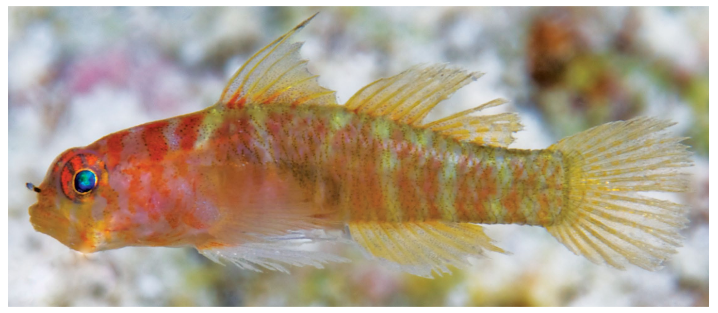
Figure 9. Sueviota atrinasa, freshly anesthetized specimen, Cenderawasih Bay, Indonesia (M.V. Erdmann).

atrinasa (Fig. 9) lack POP pores (vs. present in S. minersorum ), S. aprica has 10 dorsal-fin rays (vs. 9), and both S. aprica and S. atrinasa are very different in fresh coloration.