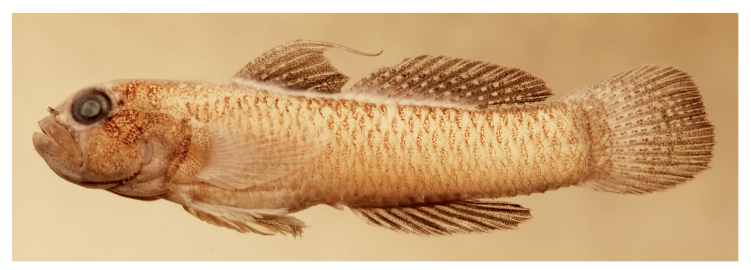
Figure 2. Sueviota minersorum, preserved holotype, MZB 25111, 18.7 mm SL, Boo Island, Raja Ampat, West Papua, Indonesia (D.W. Greenfield).

slightly obliquely upwards, forming an angle of about 65° to horizontal axis of body, lower jaw not projecting; maxilla extending posteriorly to a vertical through anterior edge of pupil; anterior tubular nares about half diameter of pupil in length, posterior nares with elevated rim; gill opening extending forward to below posterior edge of operculum; cephalic sensory-canal pores with POP, NA, AITO, PITO, AOT, SOT present. The pore and papilla pattern is the same as that illustrated for S. tubicola by Allen & Erdmann (2017: Fig. 3). Urogenital papilla of male smooth, elongate, tapering and rounded Figure 3. Sueviota minersorum, preserved holotype, MZB 25111, fused at end, reaching anal-fin base.