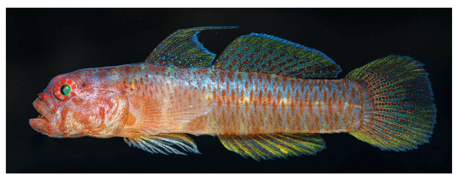
Figure 1. Sueviota minersorum , fresh anesthetized holotype, MZB 25111, male, 18.7 mm SL, Boo Island, Raja Ampat, West Papua, Indonesia (M.V. Erdmann).

Front of head rounded, snout forming angle of about 70° to horizontal of body axis; mouth terminal, inclined