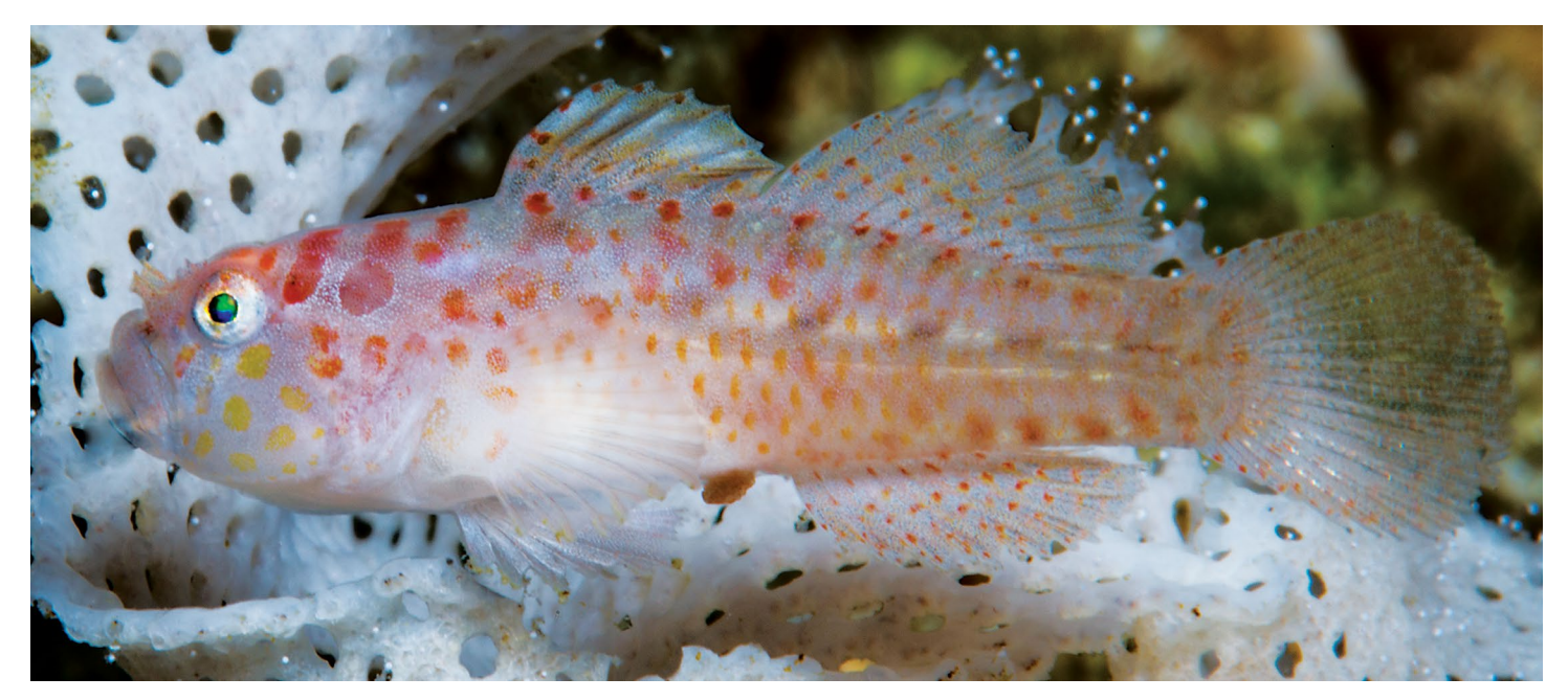
Figure 4. Sueviota bryozophila, freshly anesthetized specimen, North Sulawesi, Indonesia.

Comparisons. Only 4 other species of Sueviota have a basal membrane fully joining the two branched fifth pelvic-fin rays, i.e. S. bryozophila , S. lachneri , S. larsonae , and S. tubicola . Sueviota minersorum differs from S. bryozophila in having all pelvic-fin rays branched (vs. unbranched), having a single AITO pore (vs. paired AITO pores), PITO and NA pores (vs. absent), and in live color: S. bryozophila is a semi-translucent pale pink to whitish with scattered red spots and is covered with fine bright white speckling (Fig. 4: typical white speckling not visible).