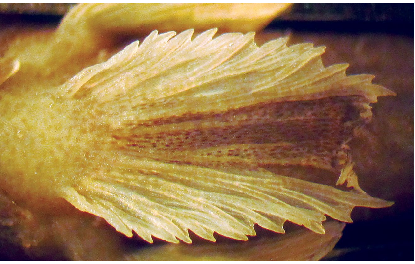
pelvic fins with no frenum (D.W. Greenfield).

slightly obliquely upwards, forming an angle of about 65° to horizontal axis of body, lower jaw not projecting; maxilla extending posteriorly to a vertical through anterior edge of pupil; anterior tubular nares about half diameter of pupil in length, posterior nares with elevated rim; gill opening extending forward to below posterior edge of operculum; cephalic sensory-canal pores with POP, NA, AITO, PITO, AOT, SOT present. The pore and papilla pattern is the same as that illustrated for S. tubicola by Allen & Erdmann (2017: Fig. 3). Urogenital papilla of male smooth, elongate, tapering and rounded Figure 3. Sueviota minersorum, preserved holotype, MZB 25111, fused at end, reaching anal-fin base.