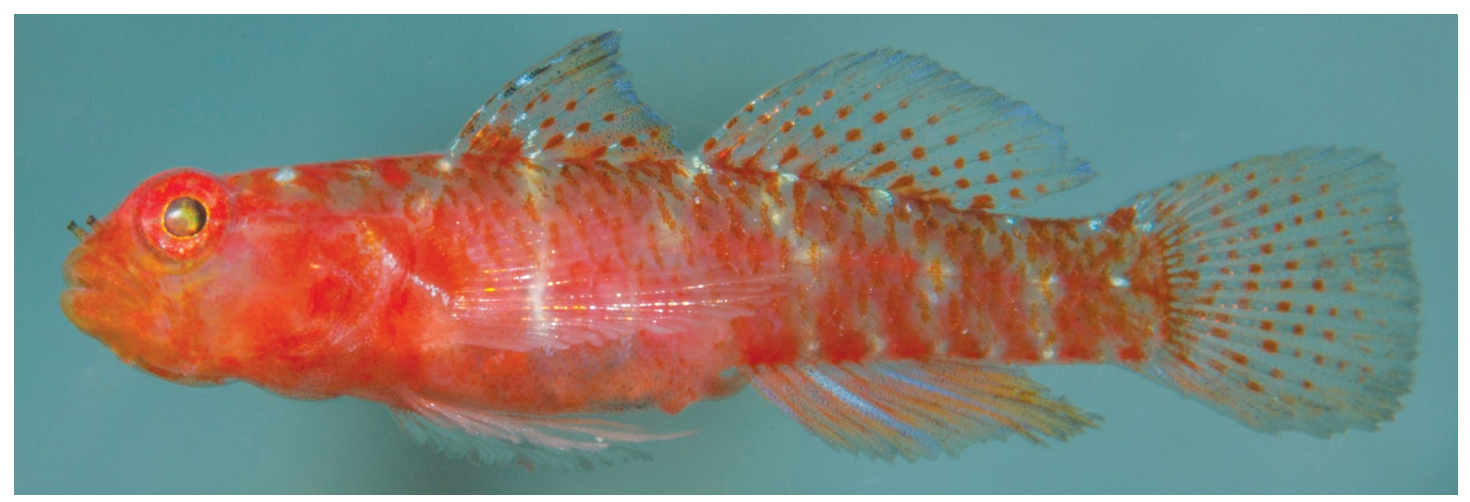
Figure 7. Sueviota lachneri, fresh specimen, CAS 247110, 15.6 mm SL, Laamu Atoll, Maldives (M.V. Erdmann).

melanophores in S. minersorum (vs. not heavily pigmented). The caudal-fin rays of S. minersorum have a series of blue squares running along their length with the rays bordered with red on each side, whereas the caudal-fin rays of S. lachneri have red spots along their length. A photograph of a fresh specimen of S. lachneri from the Maldive Islands (Fig. 7) is similar to the paratypes from the Chagos Archipelago in body shape and coloration.