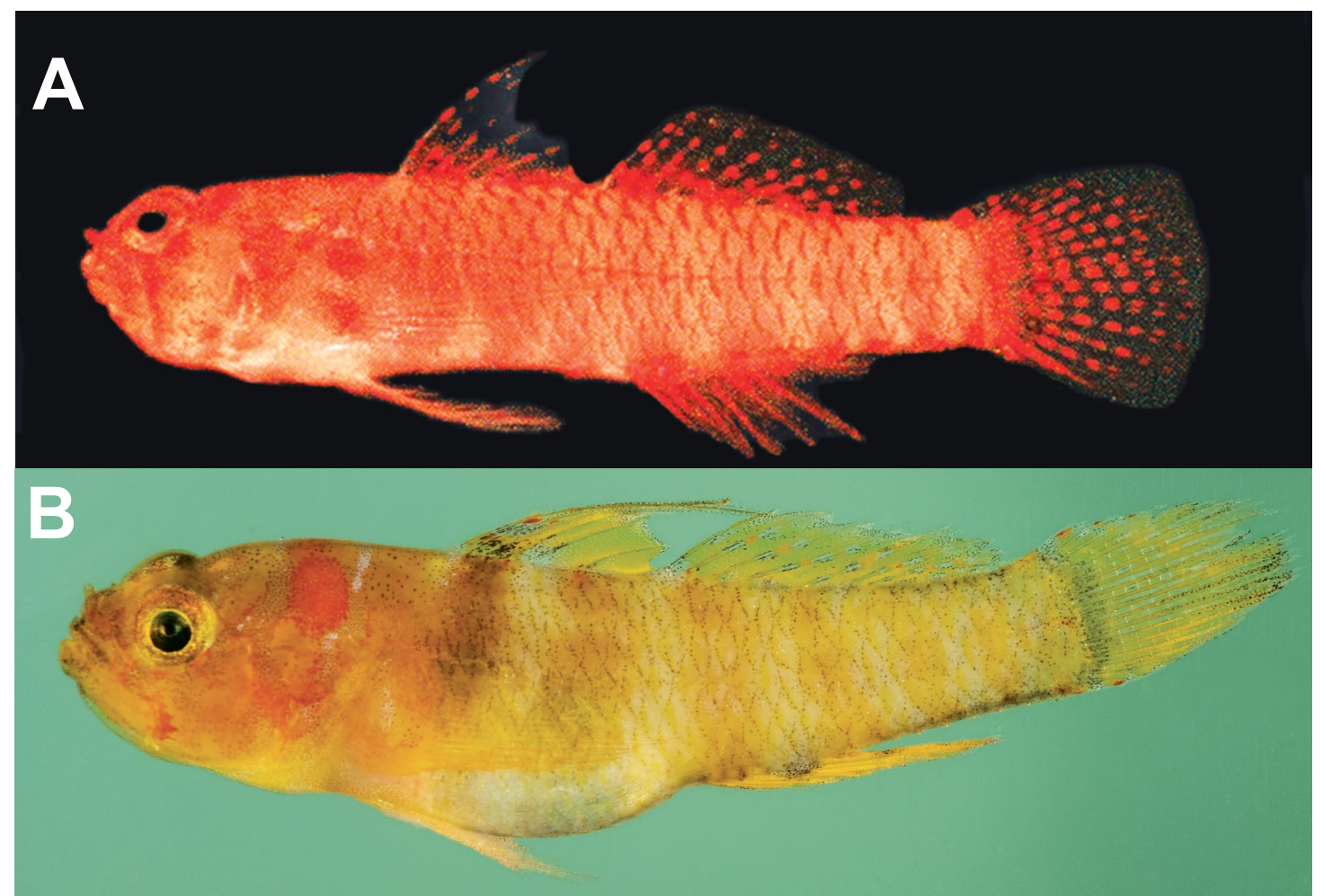
Figure 8. (A) Sueviota pyrios , fresh holotype, BPBM 13361, 16.5 mm SL, Eilat, Gulf of Aqaba, Red Sea (J.E. Randall); (B) Sueviota aprica , fresh specimen, Raja Ampat, Indonesia (R. Winterbottom).

The remaining species in the genus lack the fully developed basal membrane joining the two branched fifth pelvic-fin rays: Sueviota pyrios can be distinguished by having 8 dorsal-fin and 8 anal-fin soft rays (vs. 9/8 in S. minersorum ), and a very distinctive orange-red in live coloration (Fig. 8A); both S. aprica (Fig. 8B) and S.