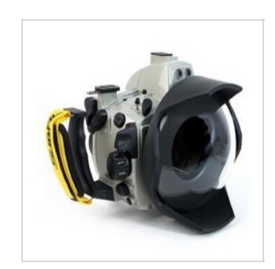
Subal ND800 Specs | Buy Now