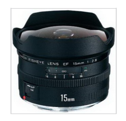
Canon 15mm f2.8 Fisheye Specs | Buy Now