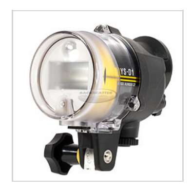
Sea & Sea YS-D1 Specs | Buy Now