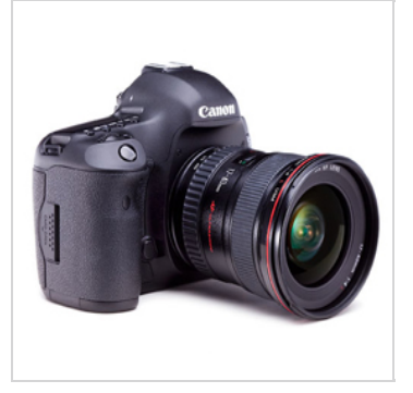
Canon 5D Mark III Specs | Buy Now