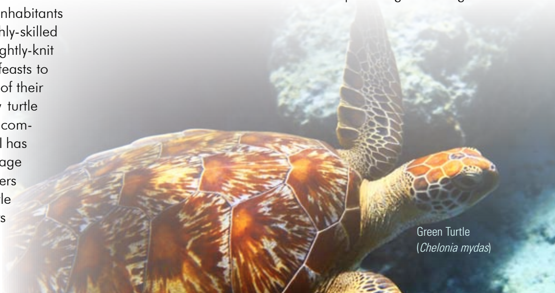
Green Turtle ( Chelonia mydas )

Until recently, Ayau's inhabitants were well-known as highly-skilled sea turtle hunters; the tightly-knit community holds large feasts to celebrate many aspects of their culture and traditionally turtle has been the preferred communal protein source. CI has worked closely with village elders and church leaders to substitute pork for turtle meat, with turtle hunters flying to Bali to learn the details of raising pigs