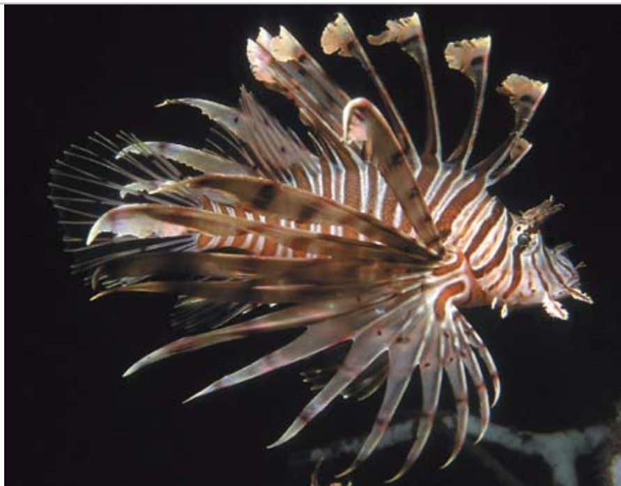
Above: New species of Lionfish ( Pterois volitans ) found in the Bird's Head Seascape.

Ecological monitoring is the marine research equivalent of going to the doctor for regular checkups. Systematic observations of species that are rare, threatened, commercially valuable or play important roles in regulating food webs is like taking the ocean's pulse and blood pressure. Well-designed monitoring programs provide managers with early detection of problems before they become acute, and provide information that allows managers to gauge the success of their con-