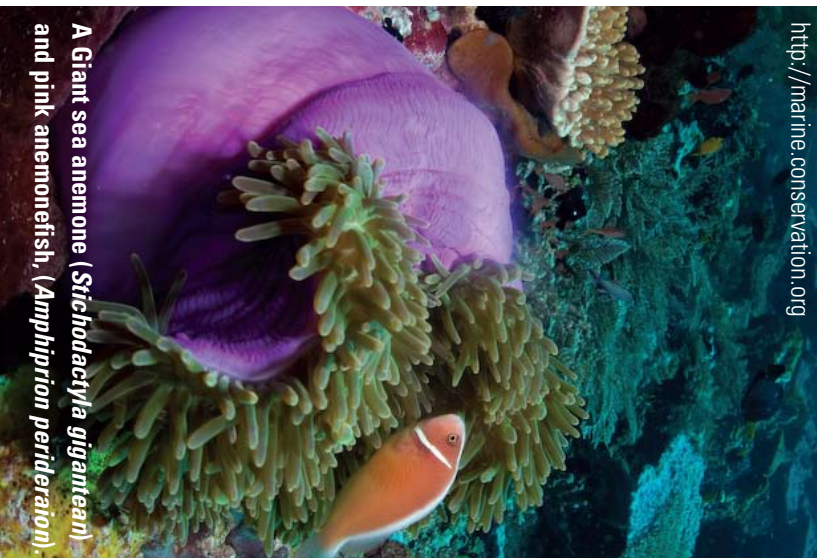
A Giant sea anemone ( Stichodactyla gigantea ) and pink anemonefish ( Amphiprion perideraion ).