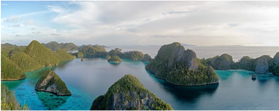
The Bird's Head Seascape is a popular destination for tourists.

During its first three years of implementation, the Bird's Head Seascape Program has focused particularly on its 'crown jewel' of Raja Ampat, though with increasing attention directed to the Kaimana Corridor. The first phase of the initiative has concentrated on elucidating large-scale ecological and oceanographic processes that structure the reefs and associated ecosystems in the Seascape as well as building a strong enabling environment for collaborative management and sustainable economic development of marine and coastal resources. Now entering its second phase, the initiative will soon expand to address the management of a Seascape wide network of marine protected areas (MPAs).