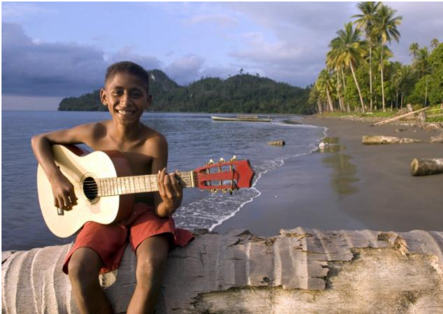
A boy from the local community plays traditional folk guitar while enjoying the sun.