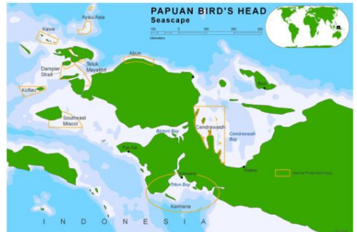
Map of the Bird's Head Seascape

Research has also shown the Bird's Head Seascape contains critical habitats for globally threatened marine species, including the largest Pacific leatherback turtle nesting site in the world, green and hawksbill turtle rookeries, and migratory cetacean aggregations of sperm and Bryde's whales, orcas and numerous dolphin species. The Seascape also boasts healthy populations of dugongs, estuarine crocodiles, giant clams, and manta rays. Without question, the Bird's Head Seascape ranks as a global priority for marine conservation, particularly given recent biogeographic analyses that suggest the Coral Triangle region exports and maintains the biodiversity of the entire Indo-Pacific marine realm.