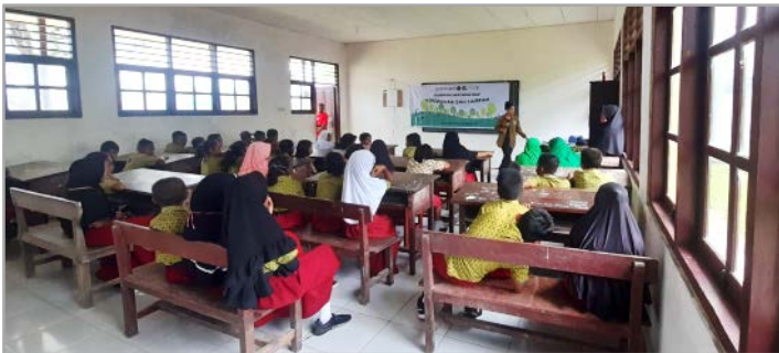
PLH in the classroom

As part of the environmental awareness raising for children in Northern Misool, on December 14-17, 2020 , YNPB carried out an Environmental Education (PLH) activities in 6 villages out of 9 YNPB assisted villages, namely Foley, Audam, West Limalas, Limalas Timur, Atkari, Solal, Salafen, Waigama, and Aduwey. The PLH team could not reach the remaining 3 villages due to bad sea weather conditions.