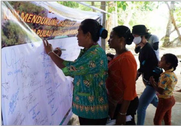
The participants signed their support for Sasi Closure and the Customary Regulations Initiative

The Sasi procession was confirmed by the signing of the sasi minutes by the village government, traditional leaders, and religious leaders from Selpela and Salio Villages.