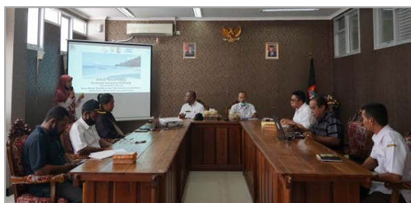
FGD on Draft Village Regulations (PERKAM)

As a follow-up to the agreement to draft the Village Regulation draft, in early November 2020, the Nusa Matan Pokmaswas assisted by CII conducted a coordination meeting with legal practitioners and Community Empowerment and Village Government Agency (BPMPK). This meeting was followed by a "Focused Discussion" which was held on November 11, 2020, at the invitation of the Regional Secretariat of Fakfak Regency in order to initiate assistance for the preparation of Village Regulations (PERKAM). This meeting was attended by the Head of the Village Community Empowerment Service, Head of the Legal Section of the Regional Secretariat of the District. Fakfak, Head of Regional Research and Development Planning Agency (BP4D), Head of Districts and TA P3MD Kokas, Arguni, Karas, and CI.