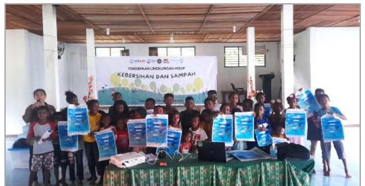
Happy faces learning and receiving a poster on key marine species in West Papua

With the theme of PLH "Cleanliness and Waste" the children were reminded to keep themselves clean and their environment clean. These PLH sessions were attended by approximately 148 elementary school students from grade 3 to grade 6 from six villages. Overall, the PLH were successful and the children were very active and happy to participate in the whole PLH activities.