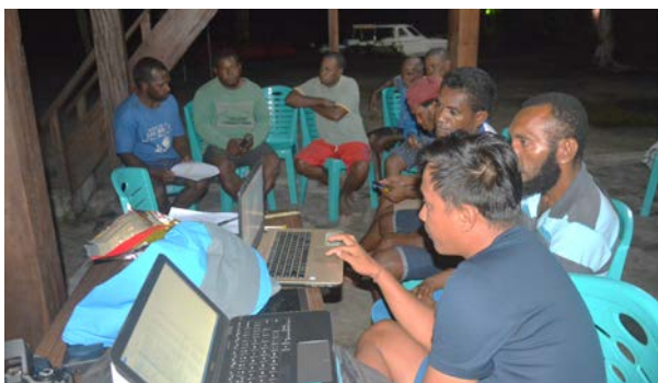
GPS Use Practices, Use of Patrol Forms and Data Entry