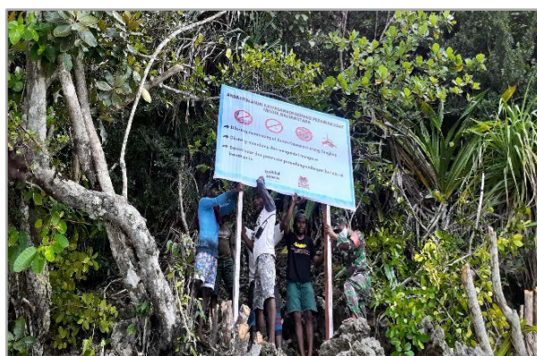
Signboard installment in Tanjung Waponta

Then, on 23-25 November 2020 , the Patrol Team installed the signboards in Foley village, after previously coordinating with the Local Government, as well as the Head and Customary Leaders of Matbat. The Patrol Team together with BABINSA and traditional elders installed a signboard at Tanjung Waponta, a cape that is very strategic and easily visible.