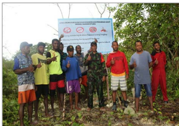
Signboard installment in Nampale Island

Furthermore, on November 27, 2020 , the Patrol Team along with BABINSA and Customary Leaders of Salafen and Waigama installed a signboard on Nampale Island with consideration that Nampale Island and its surroundings are very prone to illegal fishing. And on December 1, 2020 , YNPB and the Patrol Team continued the installation of the signboards on Pulau Tiga Aduwey.