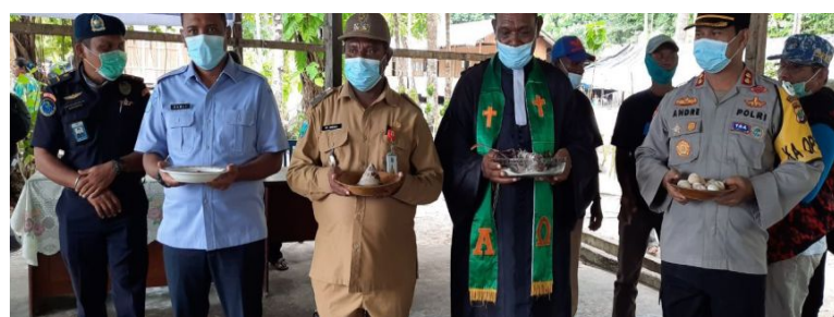
Procession of releasing biota into the sea that was received from traditional leaders of Selpelle and Salio villages, Wayag Island.

KSDA, NGOs, traditional and religious leaders from Selpelle and Salio villages, as well as the communities of Selpelle and Salio villages.