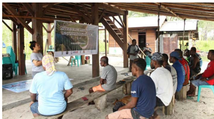
The training held in Tanjung Kasim Post

Participants were very enthusiastic and actively participate in this training as it strengthen their knowledge and skills in managing the customary MPA.