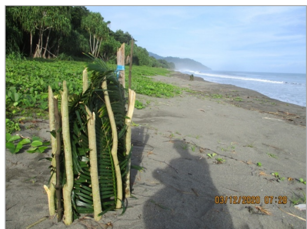
Successful Hatching of Sea Turtles in Reallocated Cages (top), a method of protecting turtle nests on the beach without reallocating the nest (bottom)