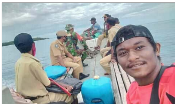
North Misool Patrol Team in action

Starting on 28 October to 18 December 2020 , Tim Jaga Laut YNPB has conducted 14 patrols in the Folley sector and the Tanjung Kasim sector of the North Misool Customary MPA, as well as joint patrols with District and Security Apparatus towards Aduwey Village. During these patrol activities, there were no infringement found around the area.