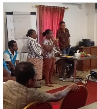
Maido Fa Fisherman Group, Kapatcol Sasi Group, and Deer Village-Owned Enterprises (BUMD) presenting their business plan

After having theoretical material on business planning and finance, the training participants were divided into groups, where each group was given the opportunity to prepare a group business plan and present it to the class.