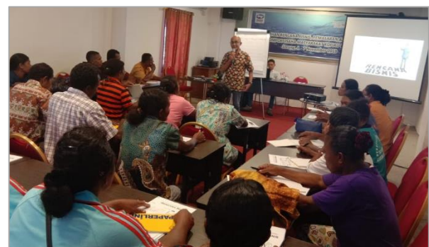
Resource Person and Participants of Busines Plan Training

As part of program implementation on Kofiau Typical Salted Fish Production and Marketing, the Maido Fa Kofiau Fishermen Group conducted a Business, Marketing and Financial Training Plan on 4-7 November 2019 in Sorong, this training aims to provide knowledge and understanding to community business groups in Kofiau and Misool, especially for the Maido Fa Fishermen Group