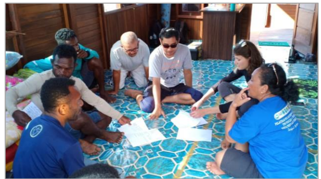
Discussion with YNP Patrol Team in North Misool Patrol Post