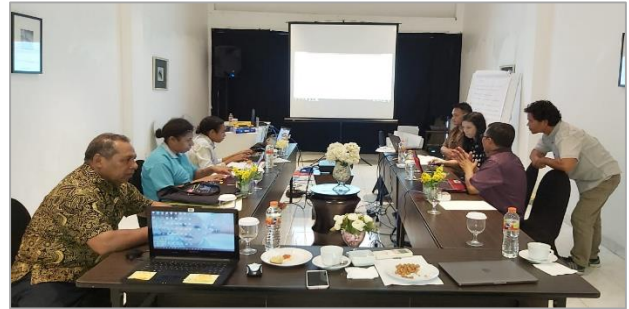
Accounting Software Training for UPTD BLUD KKP Kep. Raja Ampat

Permendagri 64 and Permendagri 79, (3) BLUD Financial Staff understands regional codes, budget codes and budget burdens and is able to use financial reporting applications according to the prepared format, (4) Availability of Financial Statements, both sourced from Grant funds and Environmental Services (KJL), and (5) Availability of quarterly BLUD financial reports that was submitted to the Office of Maritime Affairs and Fisheries Province West Papua.