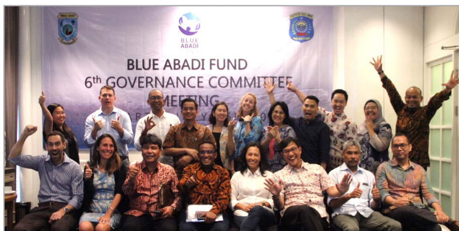
Participants of 6 th GC Meeting in Jakarta

Complementing the training on gender justice perspective that was delivered by Kapal Perempuan to BAF grantees and administrators, the 6th GC meeting concluded with a briefing session of gender mainstreaming on natural resource management, aimed to build GC understanding and perspectives on gender, especially in decision making on grant funding.