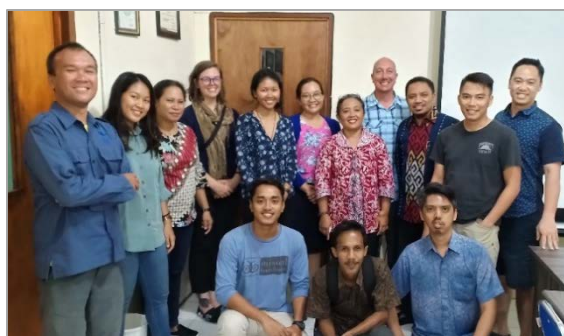
Discussion meeting with YNP, YMB and KPSR in Sorong

discussions with 9 grantees from a total of 23 cycle-1 grantees.