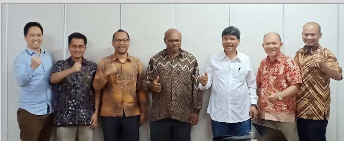
Meeting of Administrator BAF and UNIPA in Jakarta