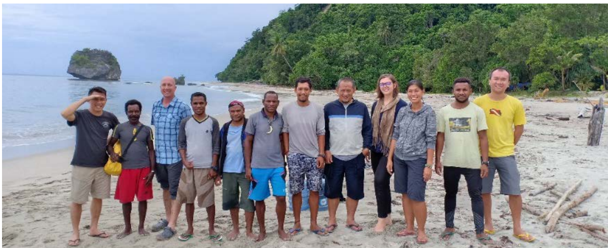
Participate with UNIPA patrol team of Leatherback turtle at Pos Batu Rumah, Tambraw

Furthermore, the USAID team also monitored the location of coral transplantation carried out by the Raja Ampat SEA Center Foundation in Kampung Sawandarek, Raja Ampat District. Out of 500m2 coral reef garden area, most of fragments (approximately 2,000 fragments) have grown well. This can be observed from the growth of acrophora hard corals around 20cm (planted in May 2018), the growth of naturally soft corals, as well as numerous fish (such as black tip sharks, napoleon, bat fish, clown fish and barracuda hordes) and turtles live around the coral transplant area.