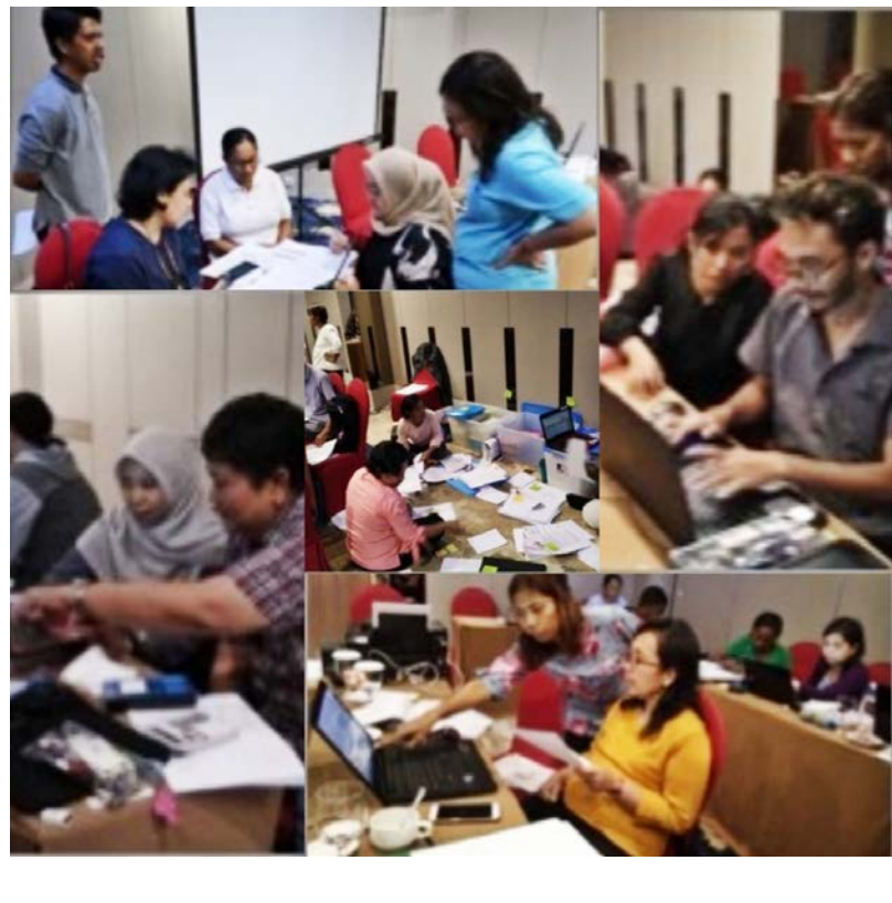
Photo 1: KEHATI (Administrator) and BAF grantees. Final Report verification of Cycle 1 in Closeout Workshop, Manokwari and Sorong.