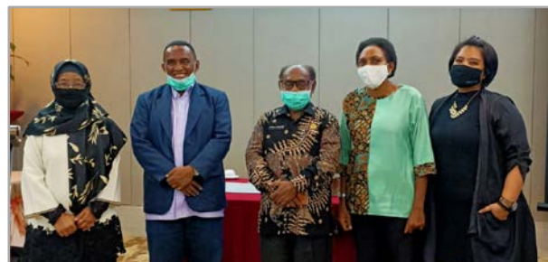
Applying the COVID-19 prevention protocol, the GC meeting was attended by the Regional Secretary of Prov. West Papua as the Representative of the Government of West Papua, the Representative of the West Papua People's Assembly (MRPB), and the Representative academics from UNIPA.

of regional and customary marine conservation areas, as well as monitoring of key species. The continuation of these activities are particularly important since thefts or destruction of natural resources still occur during the pandemic.