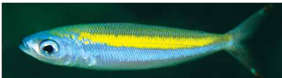
Fig. 3. Underwater photograph of Pterocaesio monikae , approximately 110 mm total length, Cenderawasih Bay, Papua Barat Province, Indonesia.

Colour in life (Fig. 3): body overall sky blue grading to silvery white on ventral portion of head and body; bright yellow stripe along side from lateral-line origin to upper half of caudal peduncle, covering maximum of four scale rows, centred just above lateral line, except entirely above it on caudal peduncle; scales of supratemporal band with yellow centres, giving impression of scattered yellow spots; similar yellow-centred scales forming faint, pale yellow stripe on upper back midway between main yellow stripe on side and dorsal fin base; pearly band from snout tip to lower anterior corner of eye; iris silvery blue; fins translucent to whitish; each lobe of caudal fin with reddish spot (often appearing black underwater), preceded by whitish area at tip.