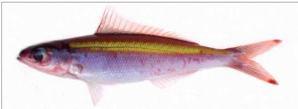
Fig. 2. Pterocaesio monikae , freshly collected holotype, 80.9 mm SL, Cenderawasih Bay, Papua Province, Indonesia.

Anterior nostril with a low membranous rim (slightly elevated posteriorly), closer to orbit than snout tip, the prenostril length 7.1 (6.4-7.5) in HL; distance between anterior and posterior nostrils 5.4