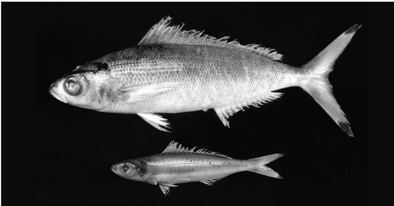
Fig. 5. Size comparison of mature adults of Pterocaesio lativittata (upper), 148.5 mm SL, Raja Ampat Islands and P. monikae , 82.2 mm SL, Cenderawasih Bay.

The two species are also readily distinguished on the basis of transverse scale row counts, above and below the lateral line (Table II). Pterocaesio monikae usually has 7 (rarely 6) rows above and 13 (occasionally 12, rarely 14) rows below compared to 9-11 rows above and 15-19 below for P. lativittata . Moreover, there