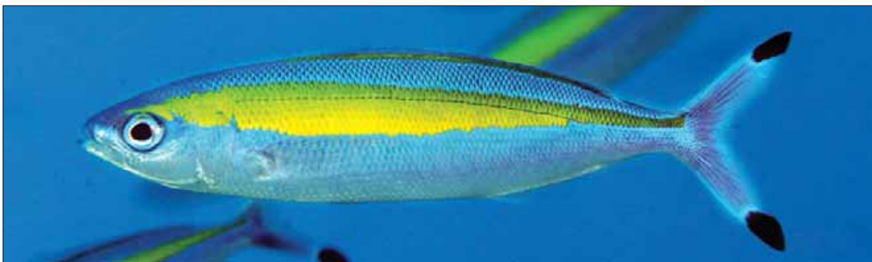
Fig. 4. Underwater photograph of Pterocaesio lativittata , approximately 200 mm total length, Christmas Island, Indian Ocean.