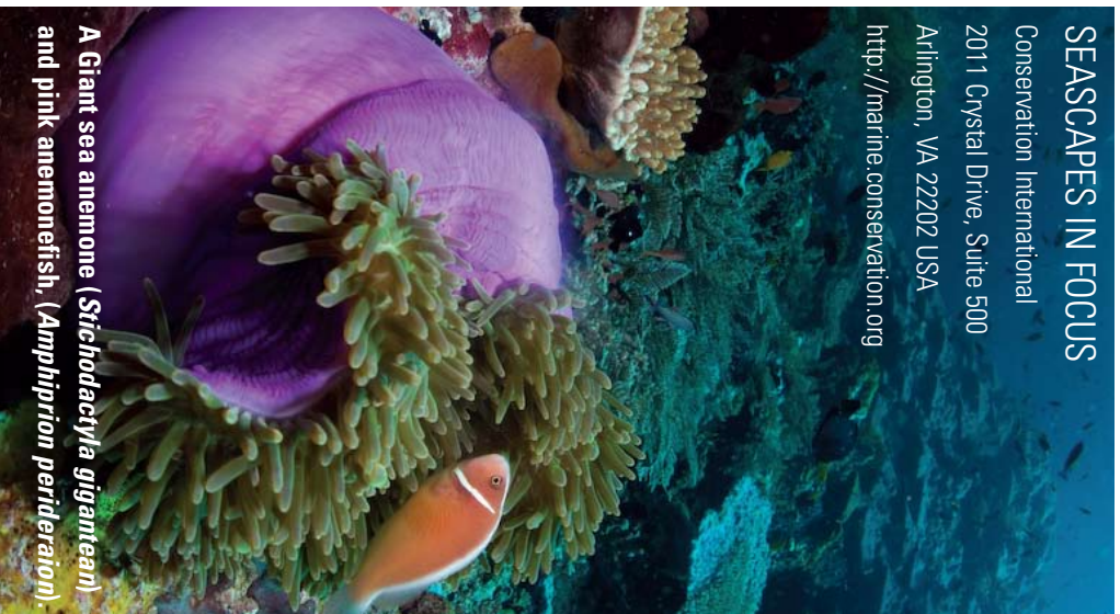
A Giant sea anemone ( Stichodactyla gigantea ) and pink anemonefish, ( Amphiprion perideraion ).