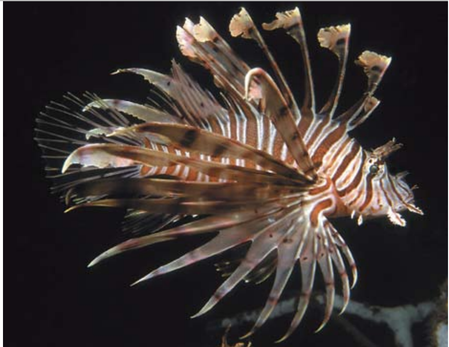
Above: New species of Lionfish ( Pterois volitans ) found in the Bird's Head Seascape.

Ecological monitoring is the marine research equivalent of going to the doctor for regular checkups. Systematic observations of species that are rare, threatened, commercially valuable or play important roles in regulating food webs is like taking the ocean's pulse and blood pressure. Well-designed monitoring programs provide managers with early detection of problems before they become acute, and provide information that allows managers to gauge the success of their con-