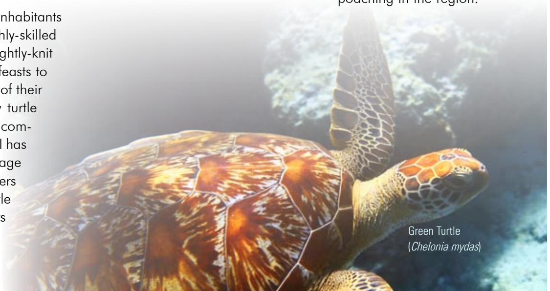
Green Turtle ( Chelonia mydas )

Until recently, Ayau's inhabitants were well-known as highly-skilled sea turtle hunters; the tightly-knit community holds large feasts to celebrate many aspects of their culture and traditionally turtle has been the preferred communal protein source. CI has worked closely with village elders and church leaders to substitute pork for turtle meat, with turtle hunters flying to Bali to learn the details of raising pigs